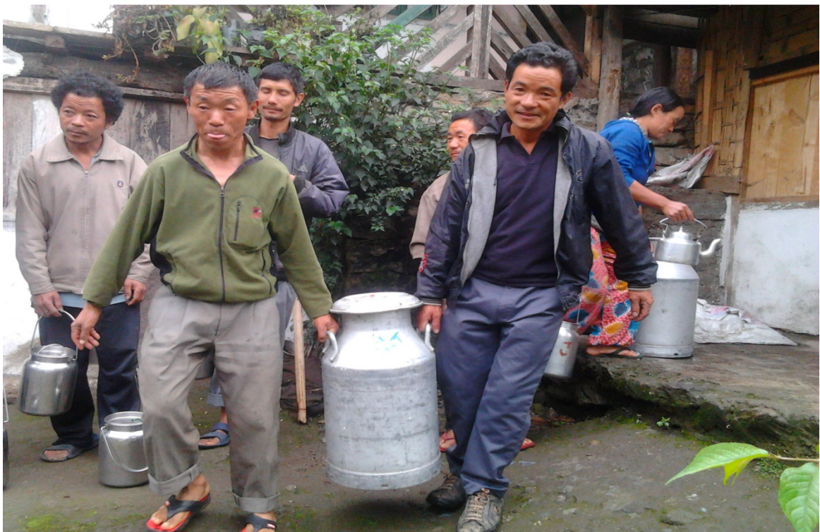
Members Hariyali SHG, Village-Dubdi, BAC-Yuksom, West Sikkim engaged in Dairy Farming Activities

The group members started the work on these cows and are earning a profit of Rs. 2250/= per member per month after paying the bank installments. After adjusting the loan amount with-in a stipulated period, the group continued their savings in their account.