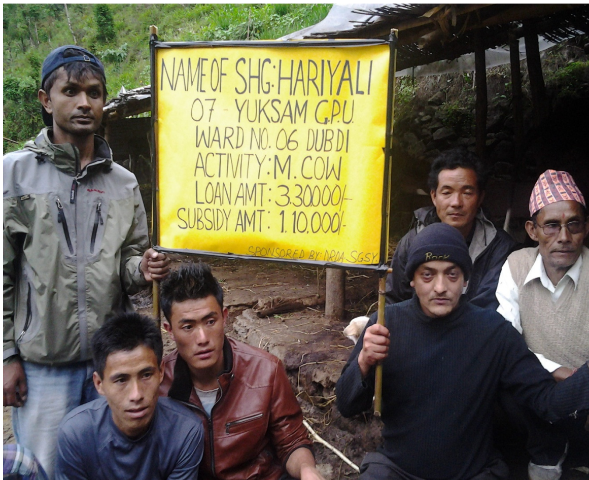
Members Hariyali SHG, Village-Dubdi, BAC-Yuksom, West Sikkim