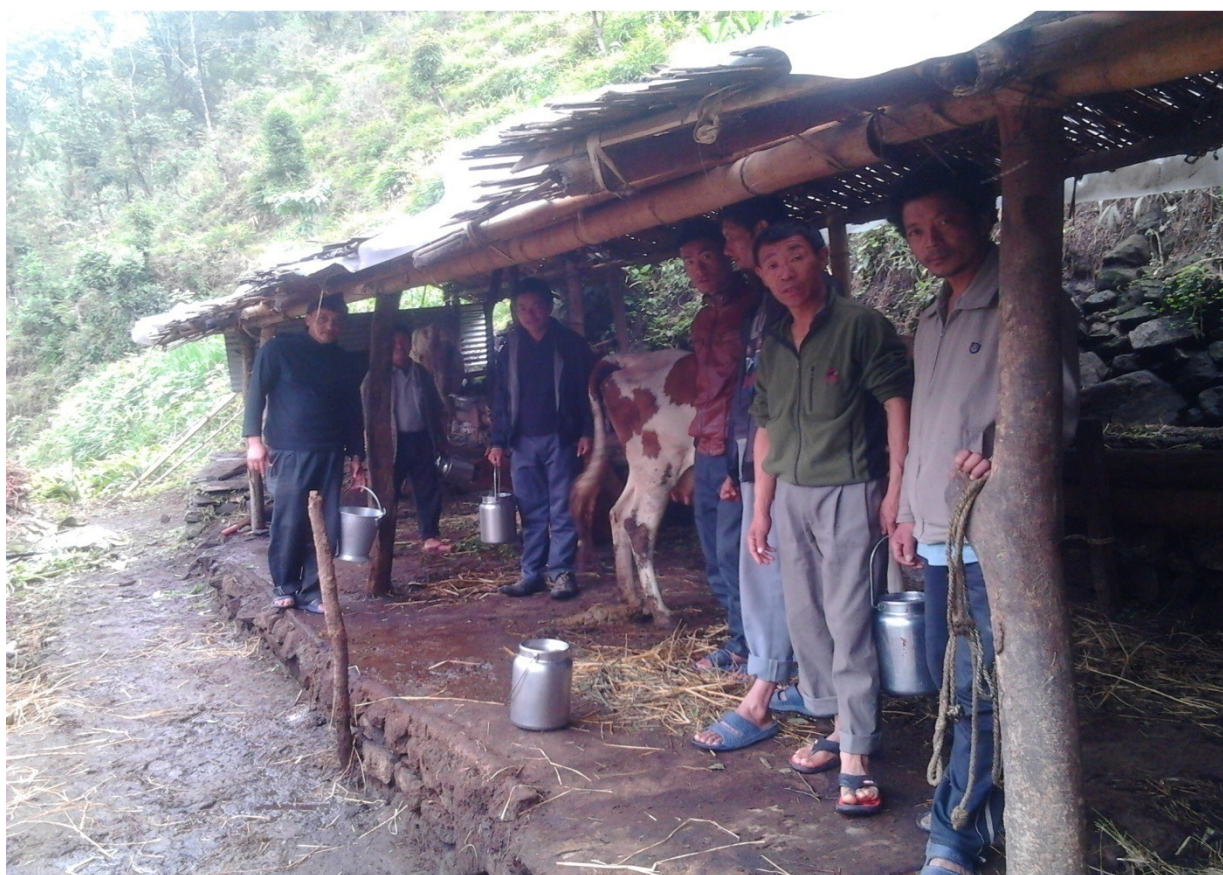
Members Hariyali SHG, Village-Dubdi, BAC-Yuksom, West Sikkim engaged in Dairy Farming Activities