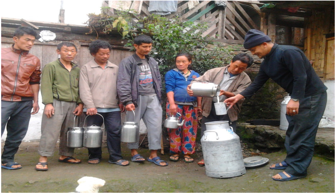
Members Hariyali SHG, Village-Dubdi, BAC-Yuksom, West Sikkim engaged in Dairy Farming Activities

The group members started the work on these cows and are earning a profit of Rs. 2250/= per member per month after paying the bank installments. After adjusting the loan amount with-in a stipulated period, the group continued their savings in their account.